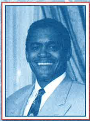
FCPC $295,566 Net Annualized Premium